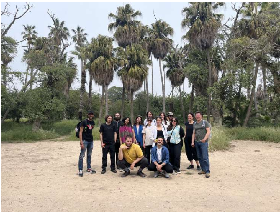
Residents of the Caravane residency in Alexandria

The artists of the Caravan residency programme , in dialogue with the curators of the residency, the social entrepreneurs (the professionals