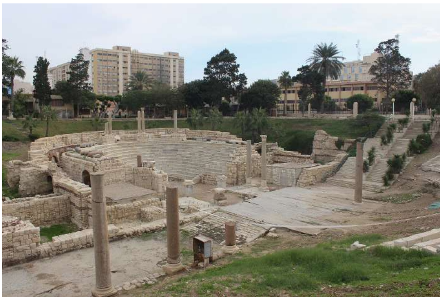
Kom el Dikka Alexandrie

The Royal Museum of Mariemont will organise a two-day conference on 28 & 29 October 2022 , presented by international specialists on ancient Alexandria.