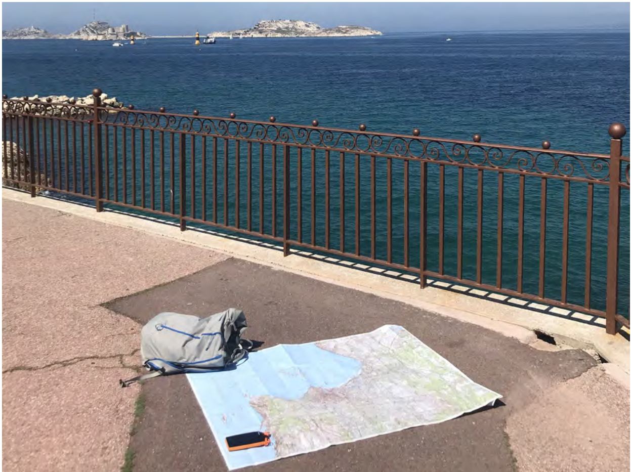
Caravan: Thinking with Alexandria, Marseille, May 2022