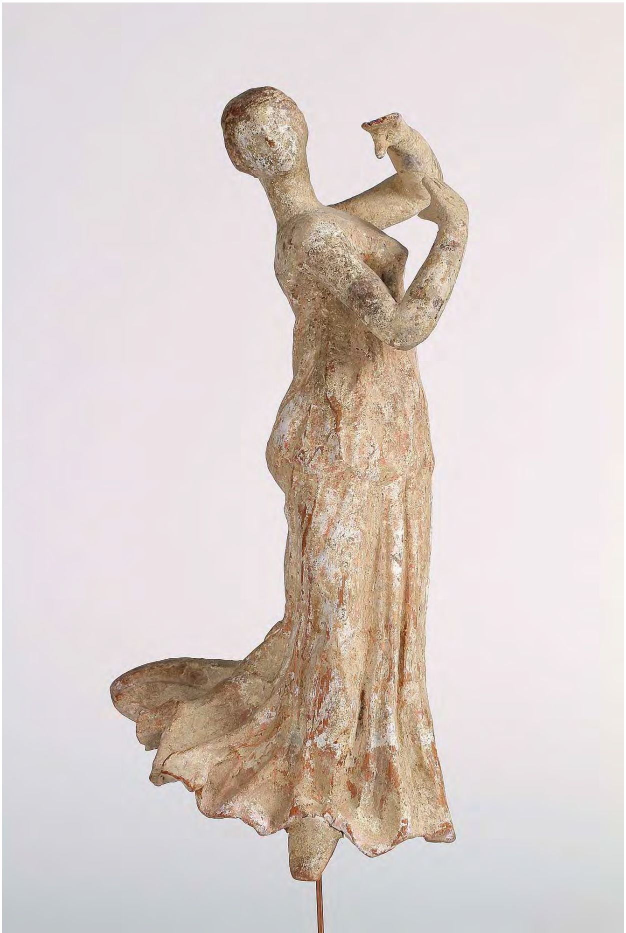
Statuette of a "tanagrea" representing a dancer, dating from the Hellenistic period (4th-1st century BC), in molded terracotta with traces of polychromy, preserved in the Royal Museum of Mariemont

This terracotta figurine, kept in The Royal Museum of Mariemont , belongs to the group of "tanagras" or "tanagreans". This name was invented in the 19th century following the discovery of similar objects on the site of Tanagra in